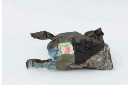
KATHIA ST HILAIRE Soda Aromatsé À La Pastèque , 2020 Heat treated Aluminum, tire skins, watermelon soda can collaged together with wire 18 x 10 x 12 inches (Inv# KS_8258)