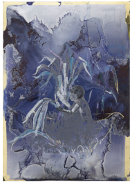
KATHIA ST HILAIRE Her Soil is Her Fortune #3 , 2020 oil based ink, gamsol, and enamel on mylar 18 x 12.625 inches (Inv# KS_8265)