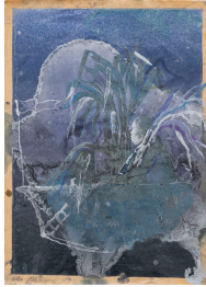
KATHIA ST HILAIRE Her Soil is Her Fortune #2 , 2020 oil based ink, gamsol, and enamel on Ingres paper 15 x 11 inches (Inv# KS_8264)