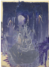
KATHIA ST HILAIRE Her Soil is Her Fortune #1 , 2020 oil based ink, gamsol, and enamel on mylar 18 x 12.5 inches (Inv# KS_8263)