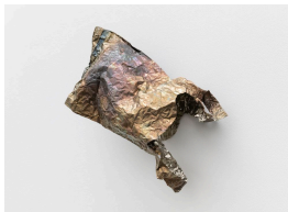
KATHIA ST HILAIRE Untitled (Heat treated bag) , 2020 heat treated aluminum with wire 20 x 17 x 7.5 inches (as installed) (Inv# KS_8261)