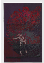
AUSTIN MARTIN WHITE The death of a cartographer(1) , 2020 jute, vinyl screen, 3m reflective fabric, rubber, pigment 78 x 50 inches (Inv# AW_8239)