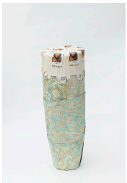
KATHIA ST HILAIRE $2.99 $2.99 $2.99 Idole Drum , 2020 oil based relief, skin lightening packaging, wire, cardboard and paper 32.5 x 10.5 x 10.5 inches (Inv# KS_8269)