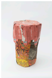
KATHIA ST HILAIRE $2.99 $2.99 $2.99 Venus De Milo Drum , 2020

16.5 x 10.75 x 10.5 inches (Inv# KS_8259)