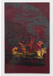
AUSTIN MARTIN WHITE The death of a cartographer(2) , 2020 jute, vinyl screen, 3m reflective fabric, rubber, pigment, graphite 78 x 50 inches (Inv# AW_8241)