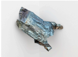
KATHIA ST HILAIRE Untitled (Heat Treated Bag) , 2020 heat treated aluminum with wire 18 x 13 x 14 inches (as installed) (Inv# KS_8260)

16.5 x 10.75 x 10.5 inches (Inv# KS_8259)