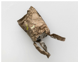
KATHIA ST HILAIRE Untitled (Heat Treated Bag) , 2020 heat treated aluminum with wire and oil paint 20 x 19 x 6.5 inches (as installed) (Inv# KS_8262)