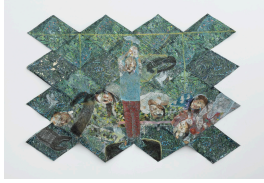
KATHIA ST HILAIRE Our Only Guide to Justice , 2021 Oil based relief, canvas, paper, enamel, tire skins, leaves pigment, fabric, metal 57 x 83 inches (Inv# KS_8257)