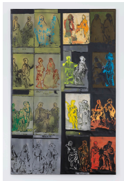
AUSTIN MARTIN WHITE castal , 2020 jute, vinyl screen, 3m reflective fabric, rubber, pigment, graphite 78 x 50 inches (Inv# AW_8246)