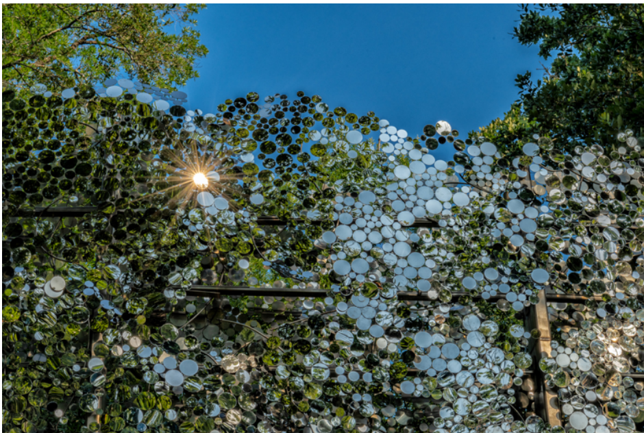
A close-up of Alyson Shotz's Scattering Surface in Hermann Park

Nestled in a tranquil spot between the Japanese Garden, McGovern Lake and the pedestrian bridge, Scattering Surface offers a peaceful retreat within the park. This temporary exhibition will remain on display through 2026.