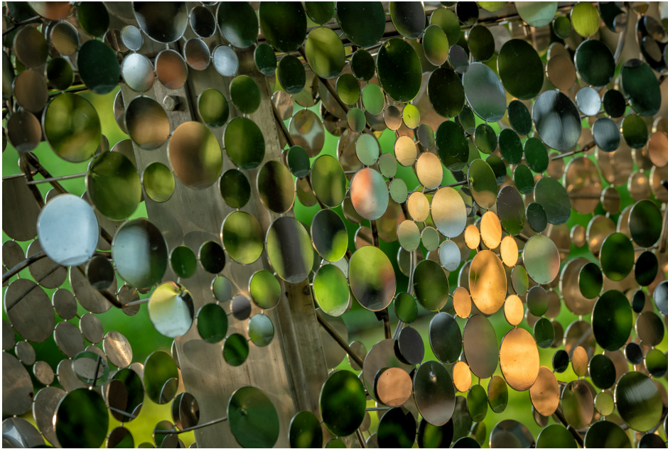
A close-up of Alyson Shotz's Scattering Surface in Hermann Park

interplay between space, gravity and light.