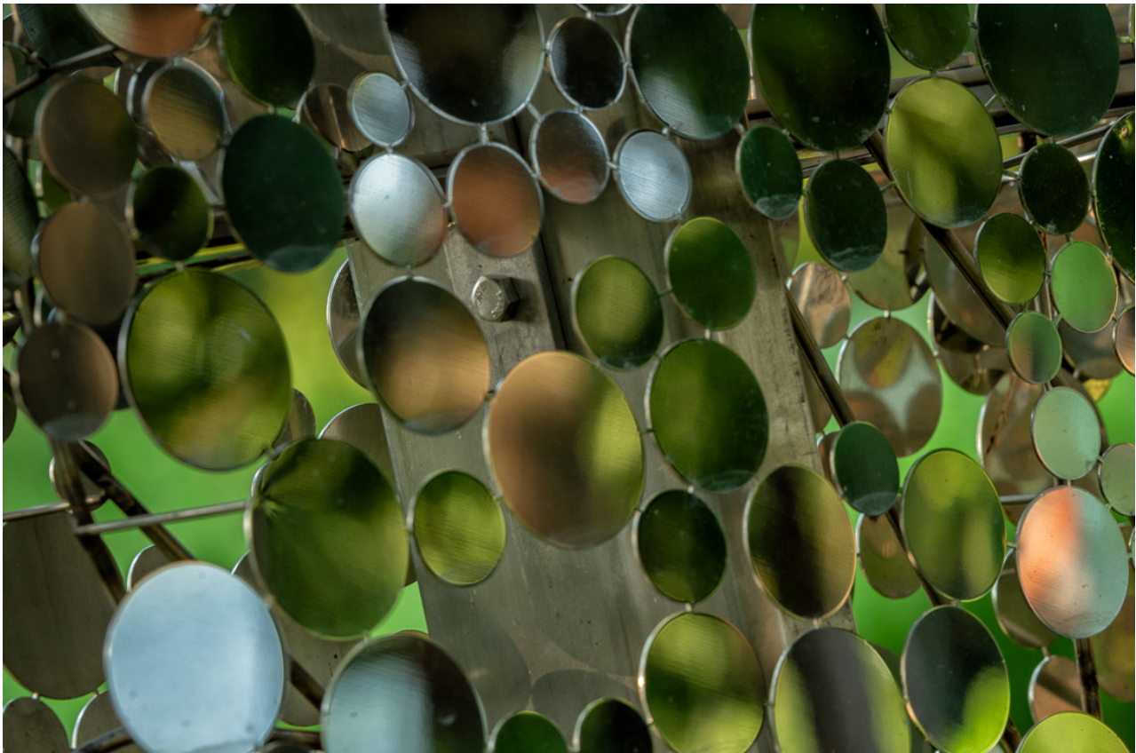
A close-up of Alyson Shotz's "Scattering Surface" in Hermann Park