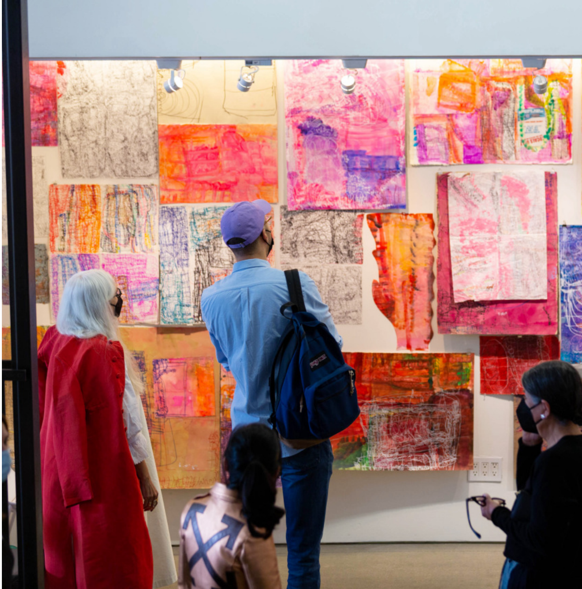
Creative Growth.