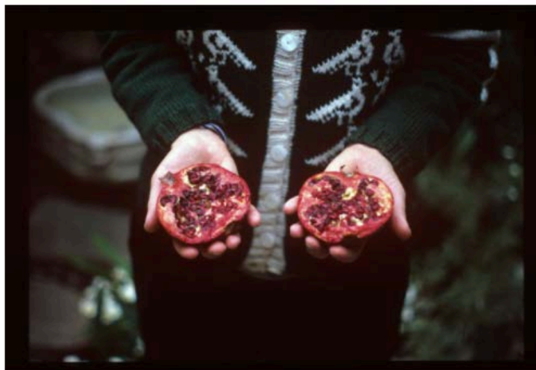
Ellen Lesperance, Dear Pippa Bacca (2011–2012). Photographic slide documentation.

Beginning in Milan, Lesperance made Bacca's same journey, collecting dyestuffs from each location, among them tea, spices, and copper, a 'saddener' in pigment terms, for its ability to darken colours. With these pigments, Lesperance rendered a painting of a bouquet by Giorgio Morandi in a set of seven grid paintings, their colours shifting based on the dyes used from each locale ( Dear Pippa Bacca , 2011–2012).