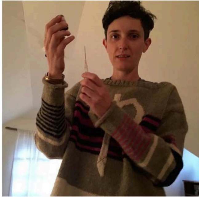
Congratulations and Celebrations (2015–ongoing). Performance documentation.