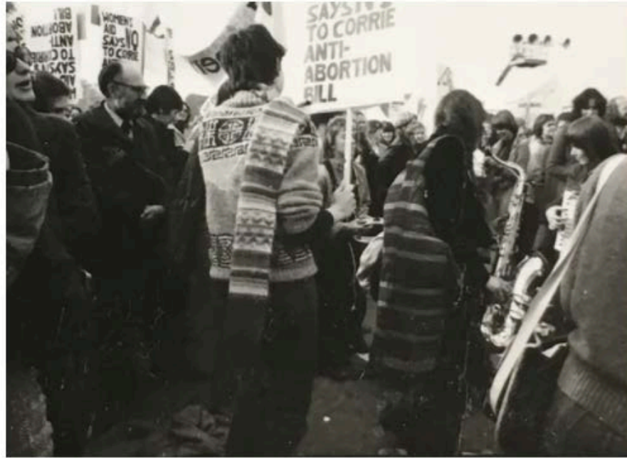
Protest against the Corrie Amendment to the 1967 Abortion Act in the United Kingdom.

Following announcement of her representation by London's Hollybush Gardens, the artist's first solo exhibition at the gallery, Will There Be Womanly Times? , runs between 1 and 31 July 2021. Included are a new series of works on paper, drawn from her Greenham Common project, alongside knitted sweaters and a slideshow of archival imagery relating to the project.