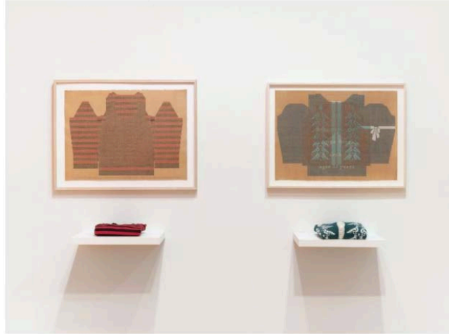
Exhibition view: Dress Codes , Ellen Lesperance and Diane Simpson, Frye Art Museum (21 September 2019–5 January 2020).

It all began at a commune outside of Santa Fe, where the artist encountered a woman named Nic who had attended the Greenham Common Women's peace camp in Berkshire, England, in 1980—a site of anti-nuclear protest in response to NATO's decision to house operational cruise missiles and nuclear warheads at the commons.