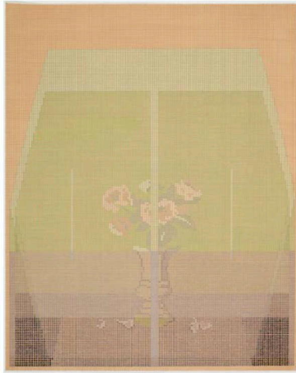
Ellen Lesperance, Dear Pippa Bacca: Croatia (2011–2012). Gouache and graphite on tea-stained paper. 55.88 x 67.31 cm.

Since her encounter with Nic in 2005, her archive has spread into new directions. In 2010, Lesperance retraced the steps of Italian artist Pippa Bacca, who travelled the world meeting midwives of small villages, washing their feet, but was devastatingly killed while in transit in Turkey in 2008.