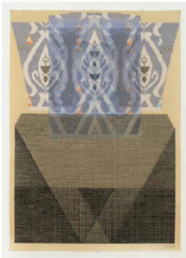
Ellen Lesperance, The Vigil (2019). Gouache and graphite on tea-stained paper. 106.7 x 75 cm. © Ellen Lesperance. Courtesy the artist. Photo: Rose Dickson.

In Congratulations and Celebrations (2015–ongoing), Lesperance further catalysed courage. Begun in 2015, the project involves a sweater bearing a labrys battle axe—a symbol of feminist and lesbian strength—that can be worn by participants as they perform their own acts of courage.