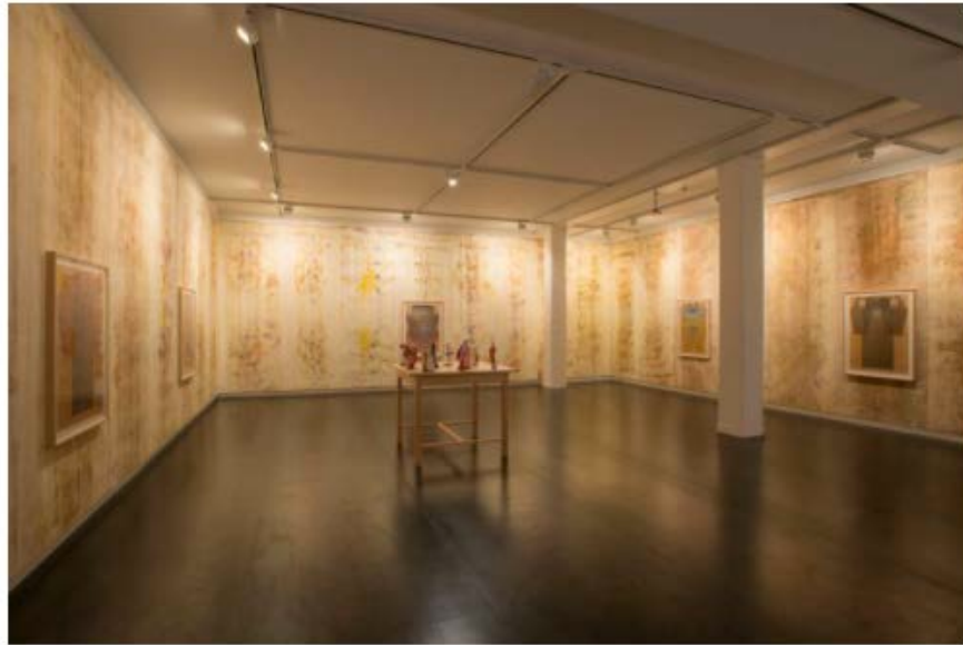
Exhibition view: Ellen Lesperance, Portland 2014: A Biennial of Contemporary Art, Disjecta Contemporary Art, Portland (6–29 March 2014).

Through such acts, Lesperance not only brings the past into the present; she extends them ever further so that they 'resound in a louder way'. Metaphor is an important element of her practice, as with her installation for the 2014 Portland Biennial, where sweater paintings were placed atop a wall covered in banners of treated silk, recalling burial shrouds.