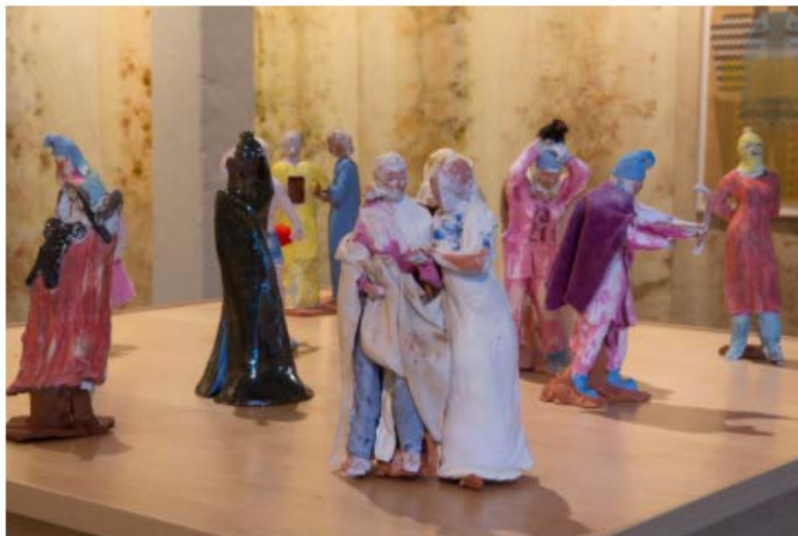
Exhibition view: Ellen Lesperance, Portland 2014: A Biennial of Contemporary Art, Disjecta Contemporary Art, Portland (6–29 March 2014).

Using a traditional Japanese dying technique that requires protein, she soaked the silk in soy milk, wrapping bouquets of flowers in their folds before burying them. Through the heat of fermentation, colour leaked into the silk to create swirling stains. At the centre of the room, a set of figurines inspired by tanagras—terracottas found in the graves of ancient women and children—took the form of Amazons and members of FEMEN and Pussy Riot.