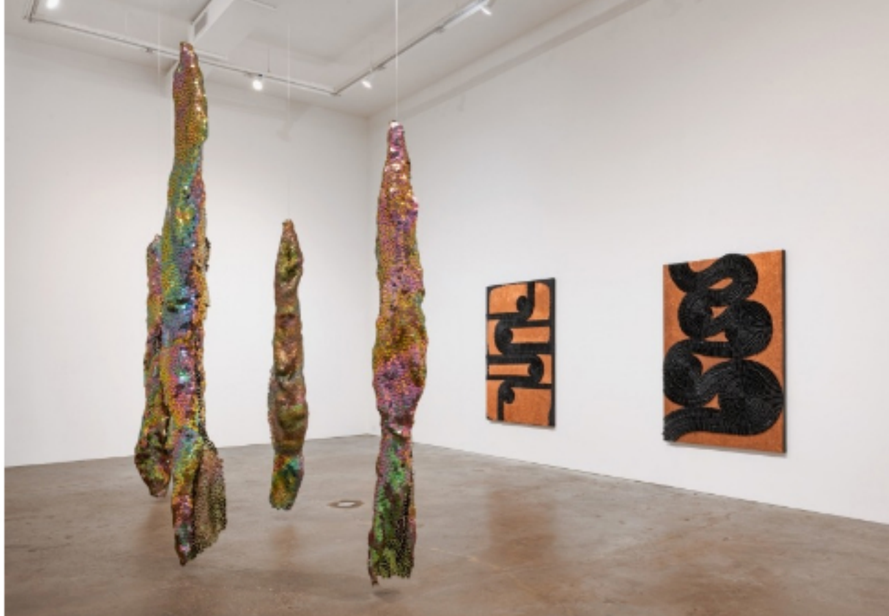
Alyson Shotz, The Small Clocks Run Wild , installation view, 2020, Intricate Metamorphosis (2020) in foreground, Chronometer series on the wall.