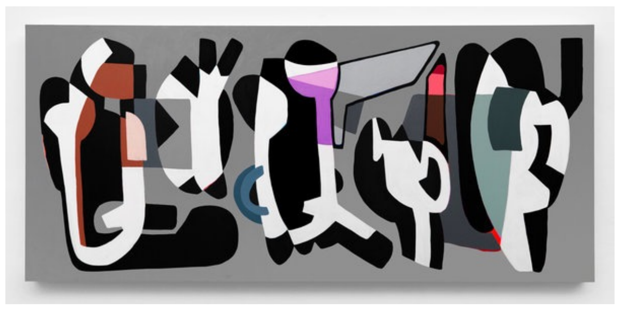
Hayal Pozanti's "Sixty Seven"

The 10 new, large-scale paintings in "Ruth Root: Old, Odd, and Oval" are irregularly shaped, with eye-popping stripes, spots and geometric forms. Standing in front of any of them, museum visitors will see that what appeared to be a single unit is actually two panels, the upper made of patterned fabric, the lower of enameled and spray-painted plexiglass. They will notice that the plexiglass panel is attached to the fabric panel by curious looping folds, and that the whole work is suspended — seemingly precariously — by a few grommets.