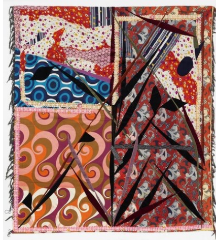
NOA ESHKOL Tree in Backyard, 1980

On a recent trip organized to Tel Aviv for the Contemporary Arts Museum Houston's patrons group we visited Noa Eshkol's dance studio and saw dancers who had been with her during her life. Seeing her dance performed for us as a simple way of being was one of the joys of my art-viewing experience, and her wall hangings as well as theories of movement fascinate me to this day.