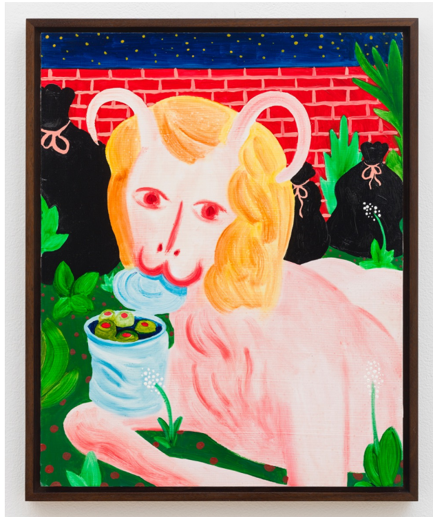
Untitled, 2015.

Because we are a Canadian-run publication and we admire those who continue to work with the arguably dated medium of paint, in the arguably dismal landscape of the Canadian art-world, we have decided to do a week-long feature on some of our favorite current Canadian painters, in no particular order. Stay tuned this week to see who we believe to be among the greatest established and emerging painters the Great White North has to offer!