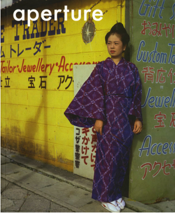
WORK AND PROCESS