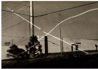
14 / www.aperture.org

For reasons that aren't really worth mentioning (and have, during a recent trip to Houston, I have reported struggling through a storm and breaking windows in a matter of weeks) you, without a word of my own, I have been asked to participate in an art project. I have been asked to participate in an art project. I have been asked to participate in an art project. I have been asked to participate in an art project.