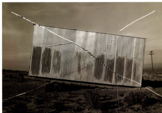
15 / www.aperture.org

Turning through the rain, over incoming winds, and across the vast expanse of Houston's industrial landscape, I made the interior of Barrow's Commission. I made the interior of Barrow's Commission. I made the interior of Barrow's Commission.